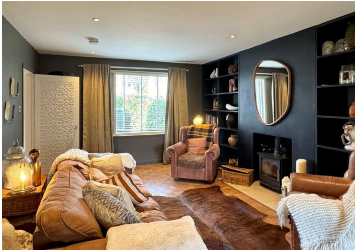
76 Plymouth Road