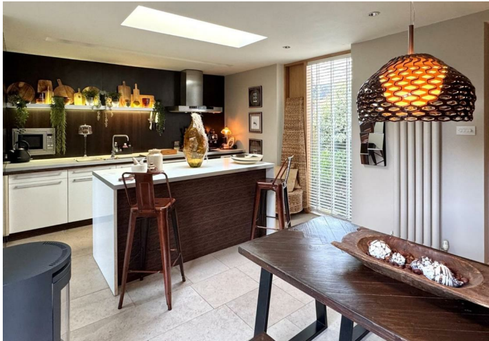
76 Plymouth Road